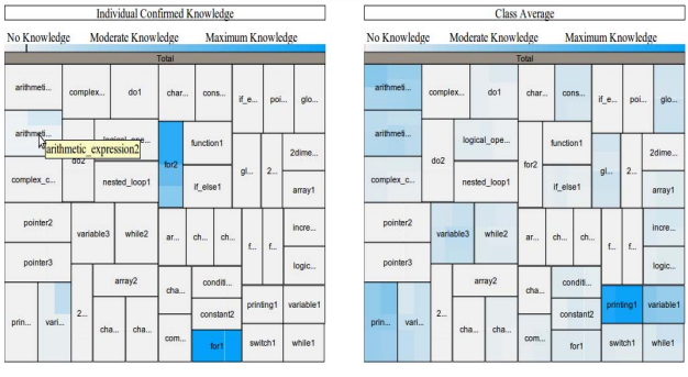
Figure 2. TreeMap Visualization of Attempts