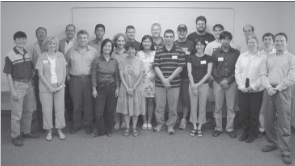
Photo taken during the incoming graduate student orientation on August 21